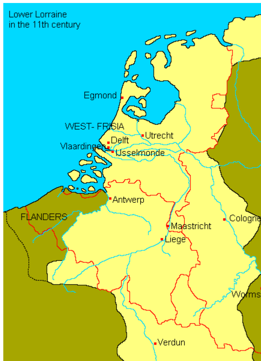
A map of Lower Lorraine in the 11th century, with the places mentioned in the text. Red lines: modern national boundaries.